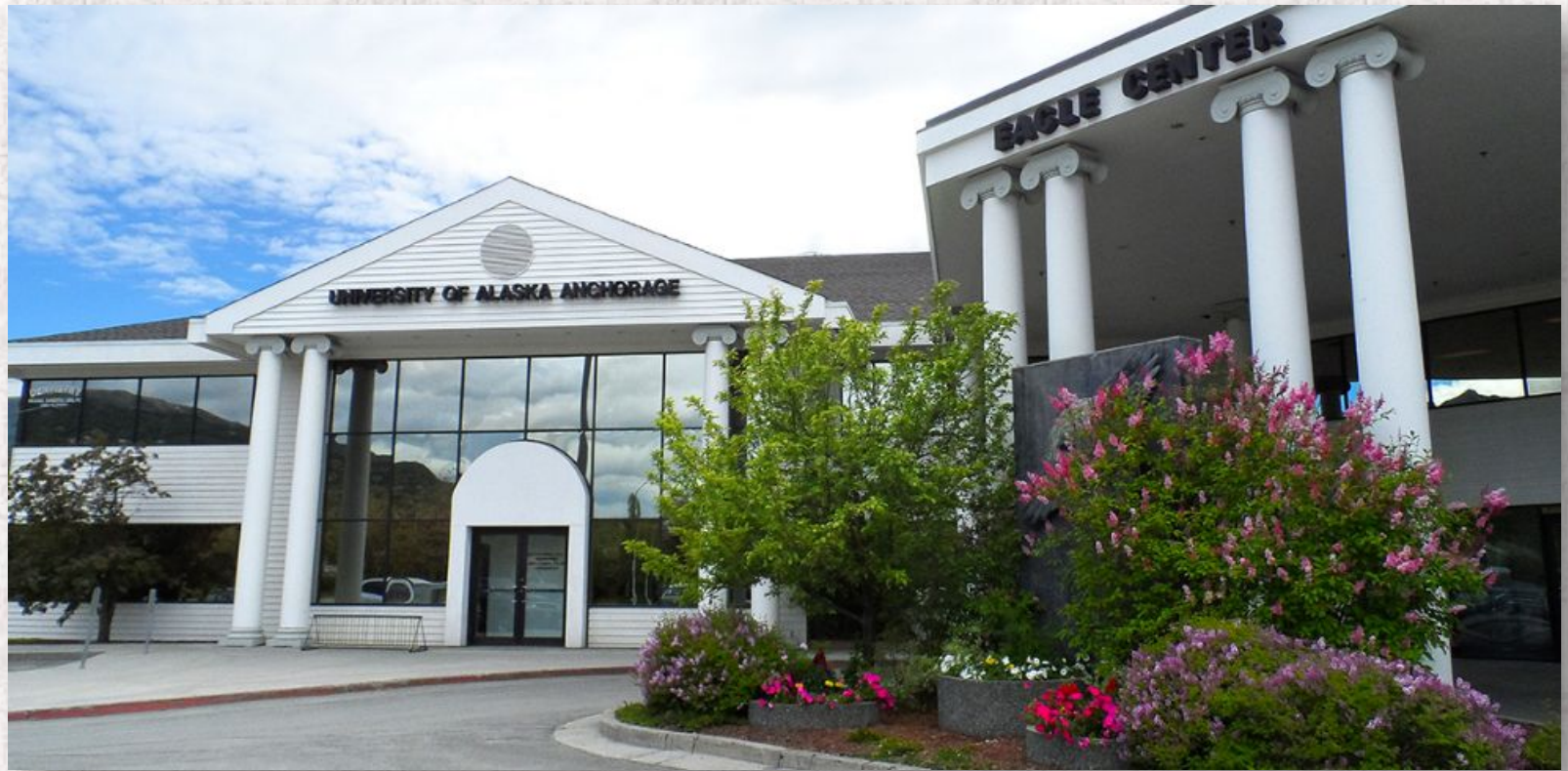
Chugiak-Eagle River Campus of UAA